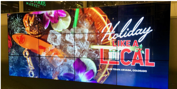
The Chestnut Pavilion Passenger Information Display

In the recent RTD Customer Experience and Community Value Research Report, satisfaction with 'Quality of Service Communications' declined from 79% in 2021 to only 59% indicating the agency needs to actively make information provision a high priority in 2023. Decisions that favor marketing over transit information are clearly at odds with any efforts to reverse this decline and put the riders first.