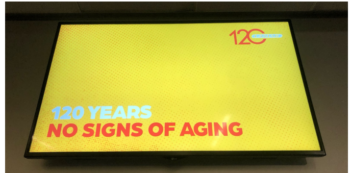
Passenger Information Display at Gate B9, Denver Union Station